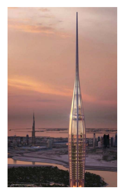
Artist impression of the tower.