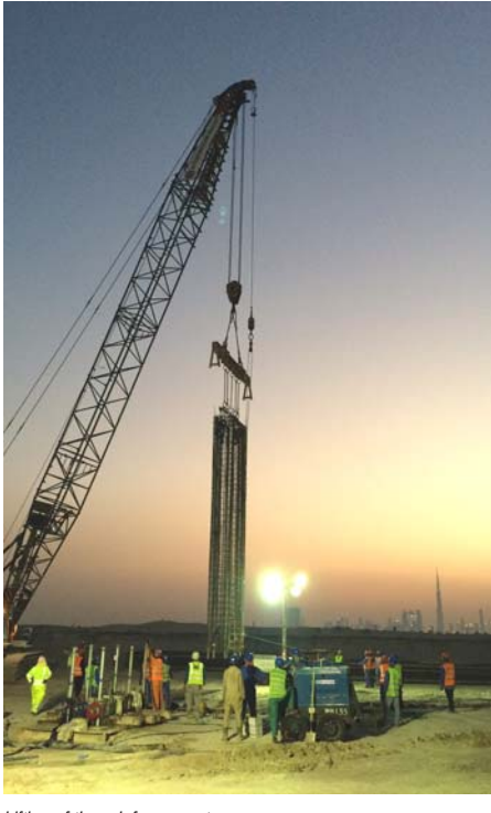
Lifting of the reinforcement.